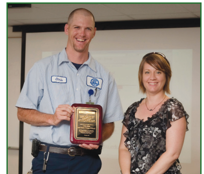
An IPM coordinator is a wise investment in a healthier, safer community.

In North Carolina, the Union County School District has saved $18,000 in fire ant treatments alone with the implementation of an IPM program in 2002 (North Carolina Public School Maintenance Association 2011).