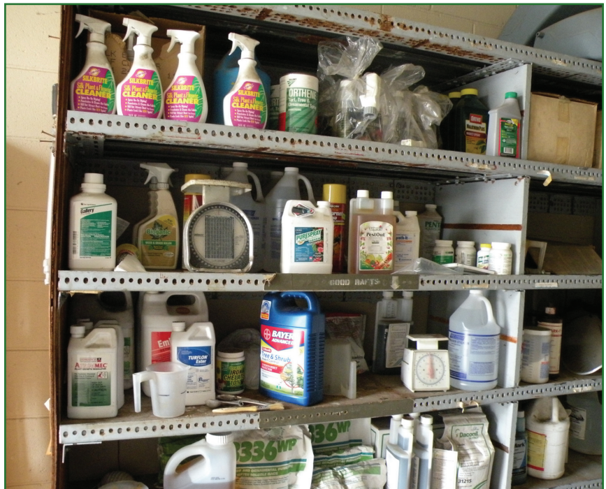
Any pesticides kept on school grounds should be stored in locked areas accessible only to properly trained and licensed professionals.

For over two decades, schools have been using IPM to reduce pesticide use and associated costs. In 1985, the Montgomery County Public Schools in Maryland made 5000 pesticide applications. Just three years later, after transitioning to IPM practices, only 600 pesticide